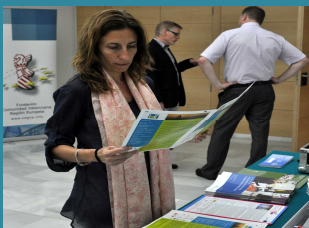
FCVRE stand in Ensa Network Seminar