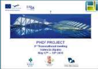
III Transnational Meeting Valencia, 17 th May 2010