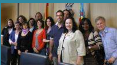
Representatives from the partner countries of the PHD 2 project

The peculiarity of this was that each participant could show the others, and the camera, the most significant places where important situations of his or her life had taken place. The final idea was to transfer the actions developed in the laboratory to daily life, to reaffirm the socialisation abilities and autonomous actions, with a view to future employment and to improve social relations.