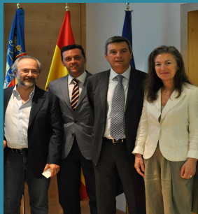
Representatives of Ensa Network and the Valencian Government (Valencia 04/06/2010)