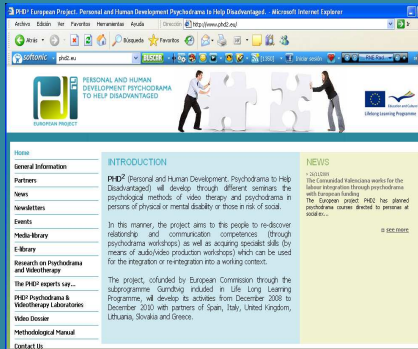
Viewing the results of the laboratories on the website of the project